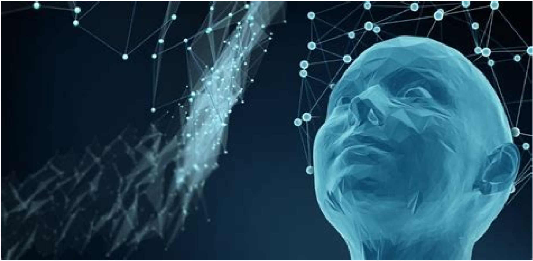
Examples of ai in india. Ai intelligence examples. A.i. artificial intelligence (2001) full movie download. Examples of ai in movies. Ai ai movies. Artificial intelligence release date. A.i. artificial intelligence (2001) full movie. A.i. artificial intelligence (2001) full movie in hindi.